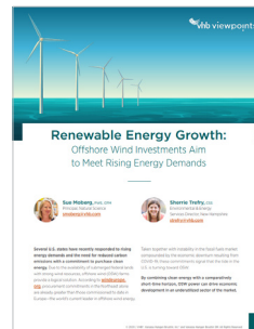
Read Renewable Energy Growth: Offshore Wind Investments Aim to Meet Rising Energy Demands