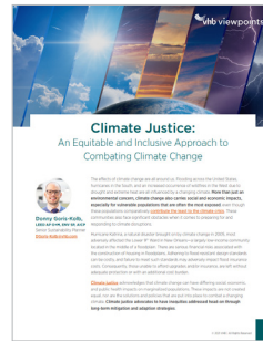
Read Climate Justice: An Equitable and Inclusive Approach to Combating Climate Change