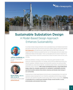
Read Sustainable Substation Design: A Model-Based Design Approach Enhances Sustainability