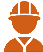
Protects industry workers