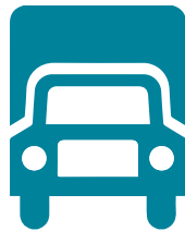
Keeps the economy moving